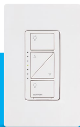
Lutron in-wall dimmer