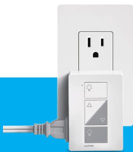
Lutron plug-in dimmer