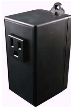
Plug In 20Amp

The TPD-GLSF compliments all surge/noise suppression devices. Improve your protection system by eliminating damage to equipment caused by different ground potentials. This situation happens when communicating with remote buildings such as a guest house, pool house, cabana, green houses etc. The GLSF is the most commonly used when electronic systems communicate between separate power sources and or ground potentials. Recommend for all systems that communicate between separately derived service entrance or meter locations. If the pool house or the guest house has its own meter and you are communicating with equipment using copper between buildings, this unit is a must! The TPD-GLSF is a high frequency filter which absorbs and locks high frequency ground currents from entering into your system. These ground currents cause immediate and wide spread damage in your system if not blocked from entering into your system.