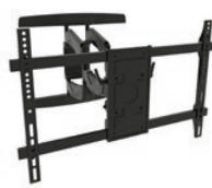
600 VESA VDM600-M