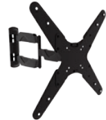
400 VESA VDM-400-M