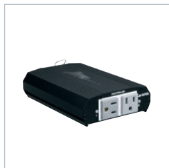
Select Series PDU with RackLink™: RLNK-215