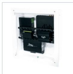
Proximity Series In-Wall Box