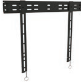
Fixed 800 VESA VDM-800-F-LP