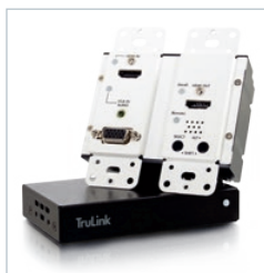
C2G® Amplifier (40880), HDBaseT, HDMI Products