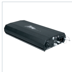
Compact surge: PD-215, PD-28-SP