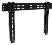
Tilt 600 VESA VDM-600-T-LP