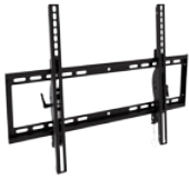
Tilt 600 VESA VDM-600-T