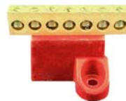
Model # TPD-GRD