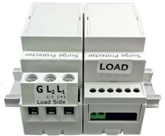
TK-LT250-30A-DIN2 TPD-24SLP4 for 4 wire or TPD-24SLP2 for 2 wire

Need additional assistance? Call Technical Support 1-800-604-9980 info@totalprotectiondesign.com www.TotalProtectionDesign.com