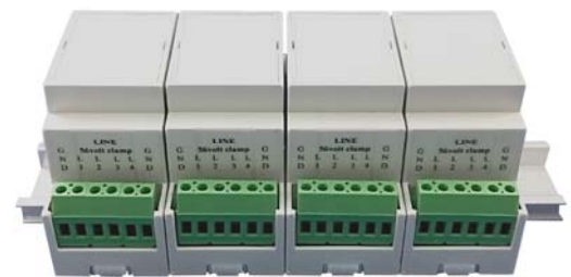
Sample picture of four TPD-AmpPro which protects 8 channels/outdoor speaker leads to amplifier.

Need additional assistance? Call Technical Support 1-800-604-9980 www.totalprotectiondesign.com